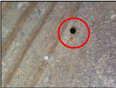
Carpenter bee hole under Bay window