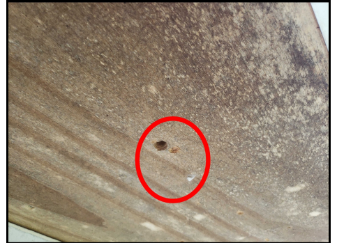
Carpenter bee hole under Bay window