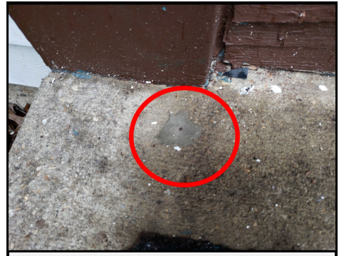
Treatment at front stoop