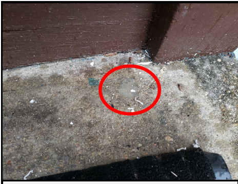
Treatment at front stoop