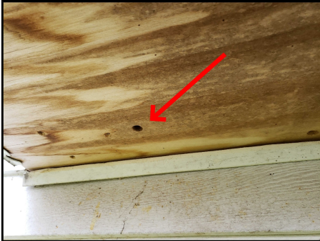
Carpenter bee hole under Bay window