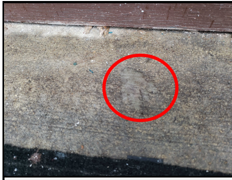
Treatment at front stoop