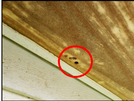
Carpenter bee hole under Bay window