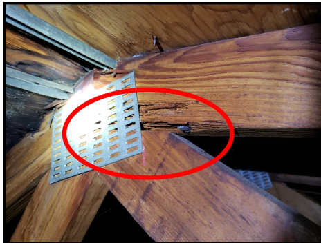
Termite damage to roof truss